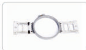
2xround hoops 15cm(5.9") per head