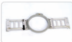
2xround hoops 12cm(4.7") per head