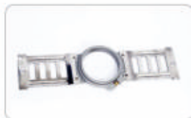
2xround hoops 9cm(3.5") per head