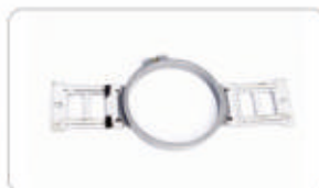
2xround hoops 15cm(5.9") per head