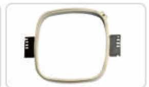
2xsquare hoops 30x30cm(12"x12") per head