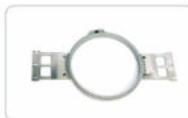
2xround hoops 19cm(7.5") per head